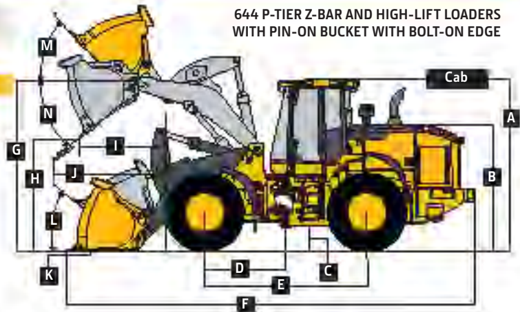
644 P-TIER Z-BAR AND HIGH-LIFT LOADERS WITH PIN-ON BUCKET WITH BOLT-ON EDGE